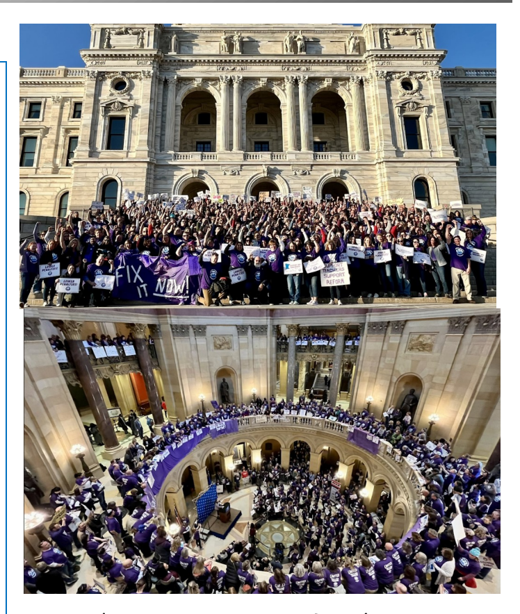
Mandates to Renew Your Teaching License

This is NOT the end of your teaching career! Use this experience to Grow! Just because you weren't a good fit for this assignment does not mean you can't be a terrific teacher. Keep your head up high and move on. For every door that closes is a brand new window of opportunity. First, show the utmost professionalism. Ask and listen to your administrator/ instructional coach/co-workers. Ask them what you can do better at your next school? Ask them what you did really well here? What was your strength? Use this information to grow and knock your next interview out of the park. Second, stay positive throughout the rest of the school year, towards staff, students, and families. This will show your strong positive character. Last, continue to volunteer for extra duties and give 100% to your job. This attitude will carry you far into the future and might even earn you a good recommendation for your next teaching job. Good luck and keep your chin up high.